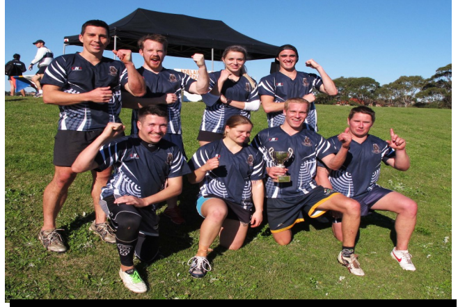
HMAS albatross were the winners at the Adelaide Cup Touch football Competition held at Randwick Barracks, Sydney