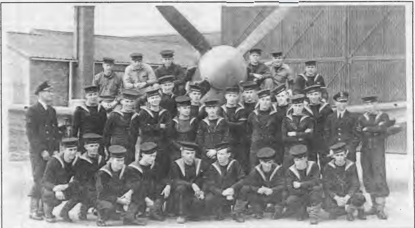
RAN Armourers under training at RNAS Yeovilton - 1948

AIRCRAFT: - SG3 - SEAGULL, SF - SEA FURY, VA - VAMPIRE, WAL - WALRUS, TM - TIGER MOTH, IR - IROQUIOS, SFI - SEAFIRE, GT - GANNET, A4 - SKY HAWK, FY - FIREFLY, SV - SEA VENOM, WX - WESSEX, ALB - ALBACORE, HC - HELLCAT.