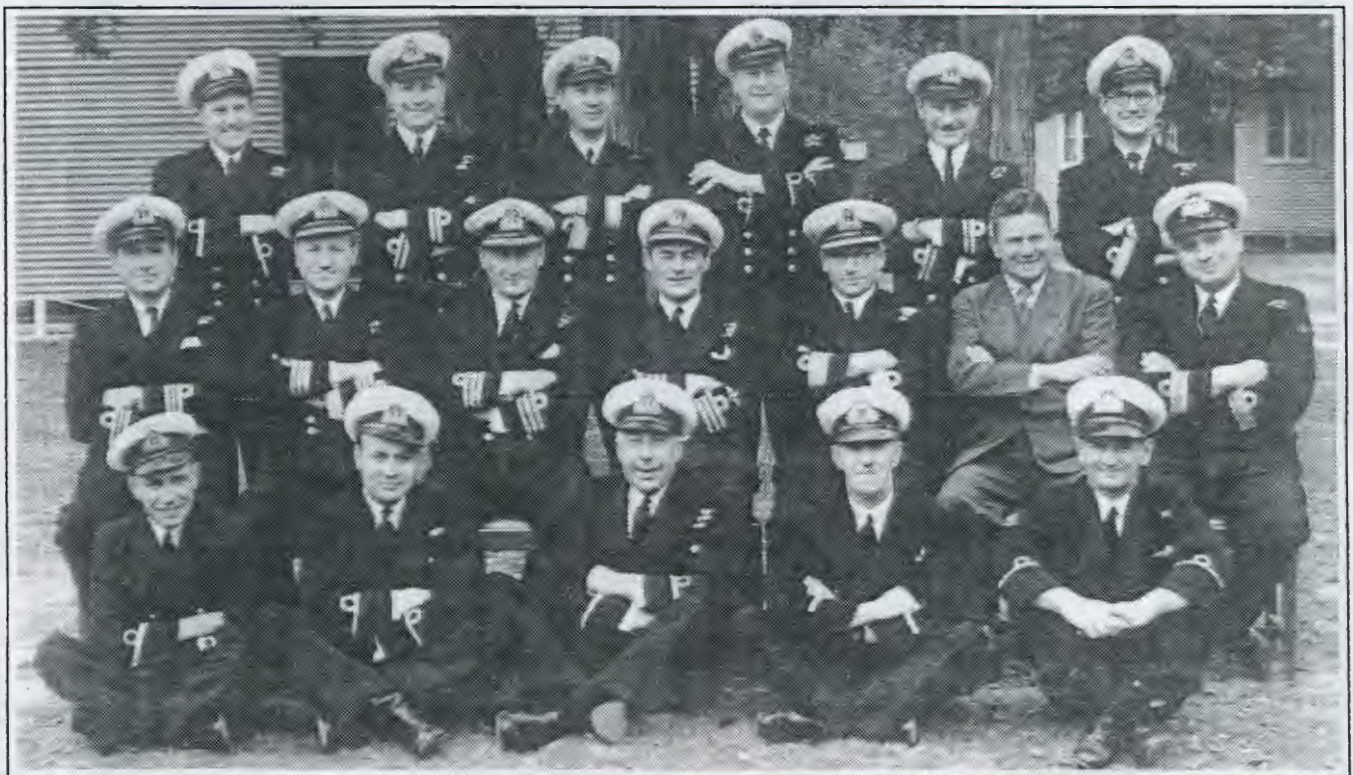
HMAS Albatross Officers - Commissioning Day 31 August.