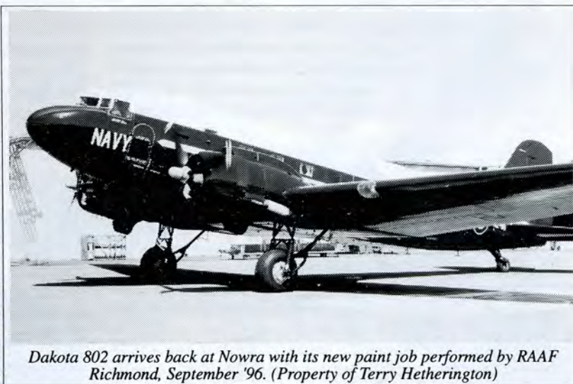
Dakota 802 arrives back at Nowra with its new paint job performed by RAAF Richmond, September '96.

After years of delays there now seems to be real hope of having the Firefly's engine fully overhauled in the USA next year, and having it improved with the installation of later series camshafts and rocker gear which should see the last of those nagging valve-train problems.