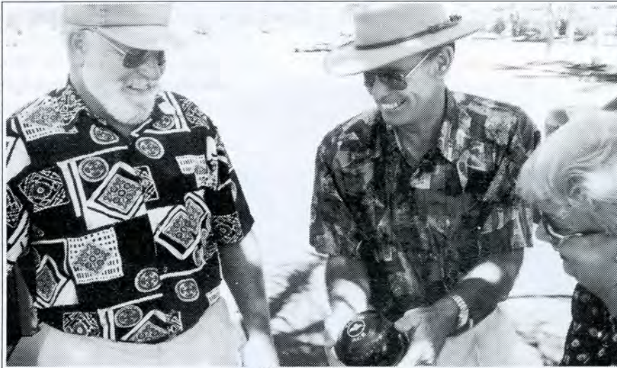
Fly Navy Bowls