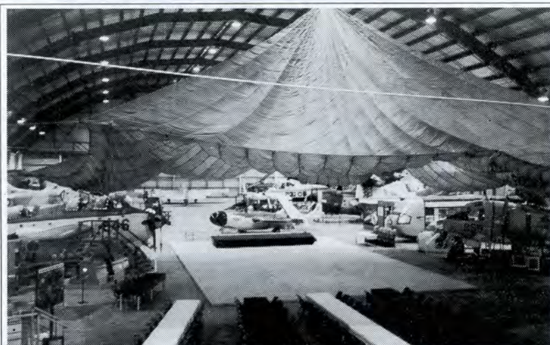
Hangar 6 set up for The NSW Line Dancing Competition

We embarked on a New Work Opportunities programme with the Department of Education and Training and took on 8 long term unemployed personnel to restore the Museum's Firefly. This aircraft was the 'gate guard' to HMAS ALBATROSS in the 50's on completion of its operational service and has had four or five coats of paint in its life. The 26 week programme enabled a complete strip down, rebuild and aircraft spray painting to be achieved - there was also a complete transformation of the crew.