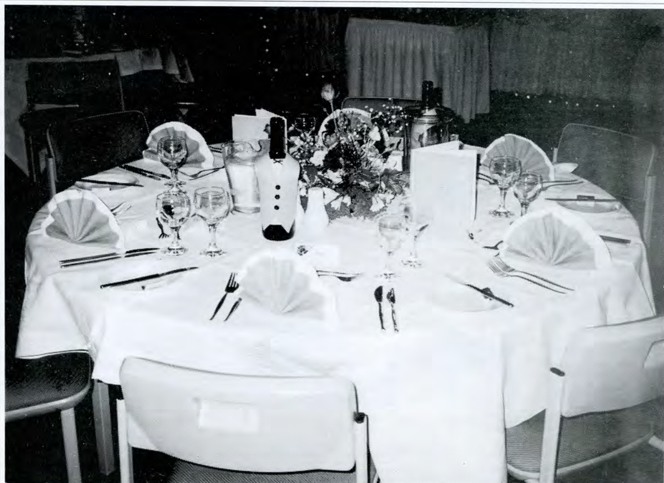
Our Wedding Table Setting