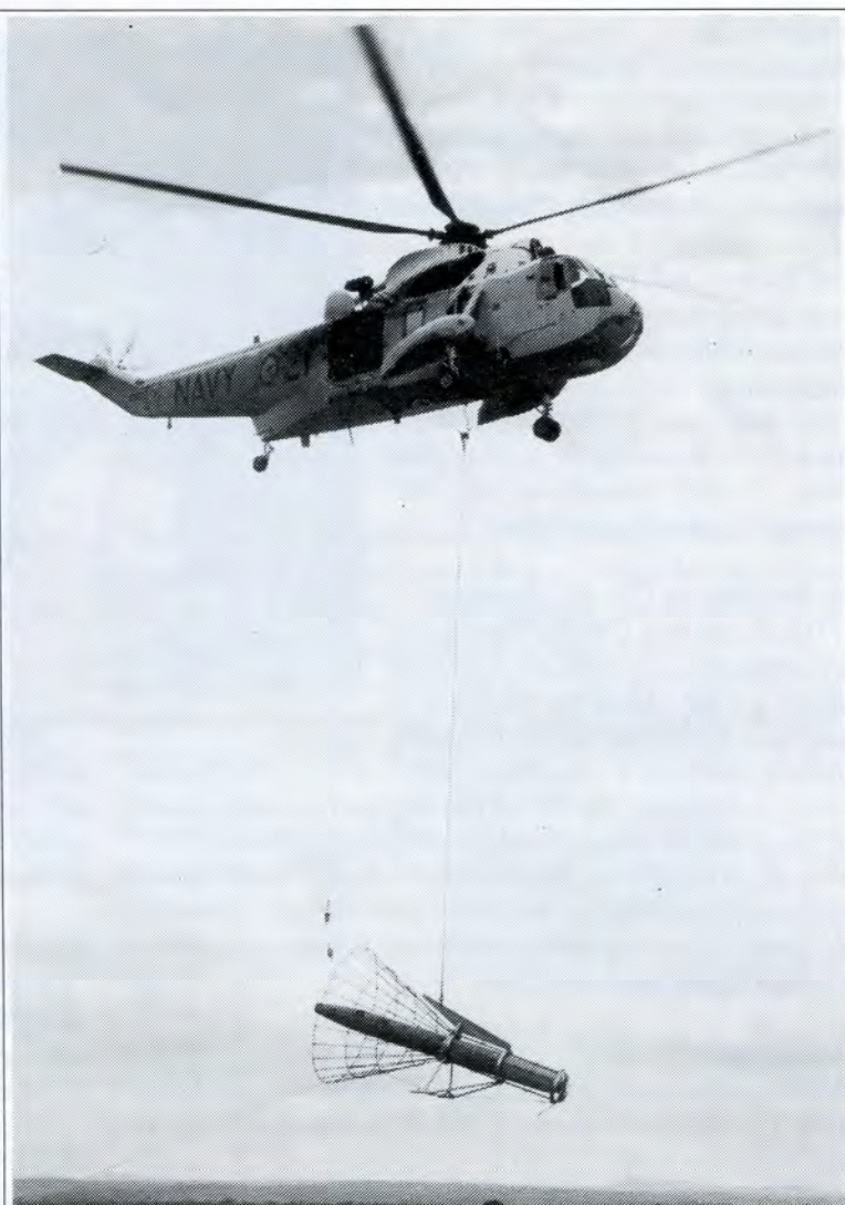
A Sea King carrying a Mark 48 Torpedo Submarine viewed from the Function Centre

The next Stage in our development is to install a 150 sea theatre/state of the art conference centre, administration and curatorial facilities and, an additional eating area and toilet facility. It is planned to have the theatre completed and officially opened at our 50th Anniversary.