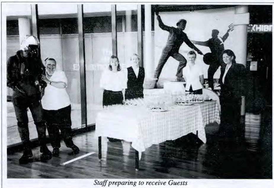
Staff preparing to receive Guests

The early planning has been made to ensure our 50th Anniversary dates are secure.