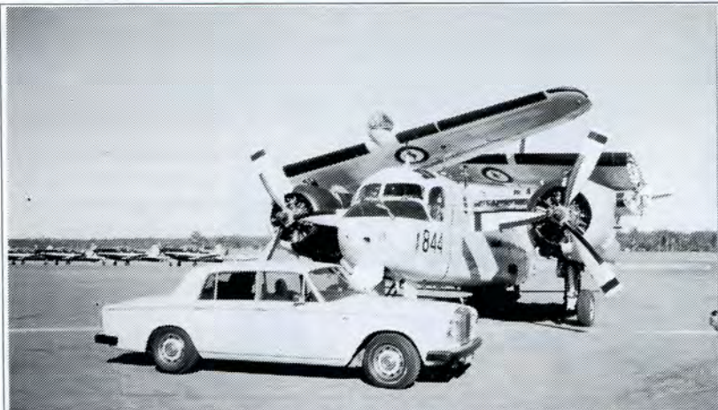
The crew of Traker 844 enjoy first class transport in the air and on the ground. This was at Kingaroy, Queensland earlier this year.