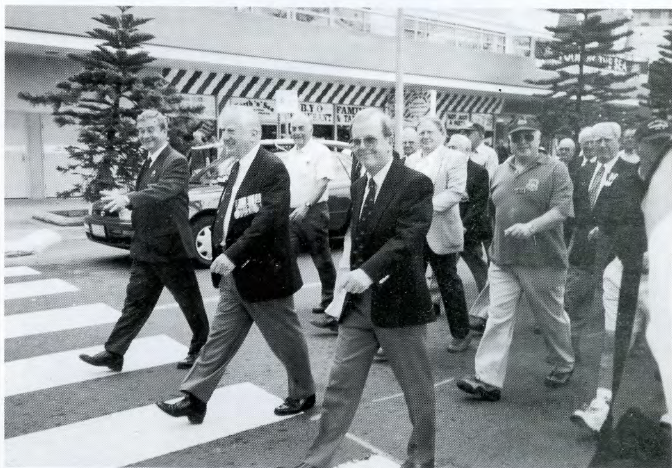
Toz leading the March