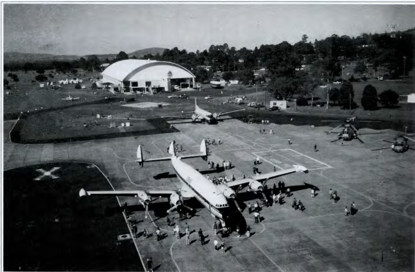
Super Constellation visiting the Naval Aviation Museum 1996